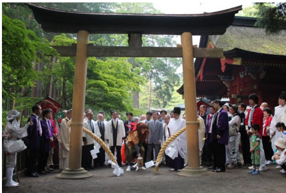
↑Mt.Fuji Opening Eve festival

A lot of events related to Mt.Fuji or Fujigoko area are held in Fujiyoshida. The first is “Fujisan-Kaizan-Zenyasai”. It is an event to walk from Nihonbashi to Mt. Fuji from 5 days before July 1st. It is jointly planned by Fujiyoshida City Hall and Tsuru Shinyo Kumiai, and provides participants with rest areas and accommodations.