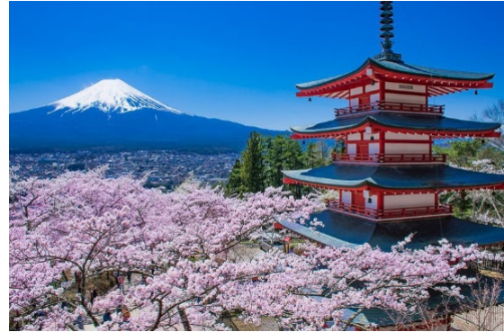
View at Chureito

Also, they hold some night events for guests spending the night to enjoy evening contents in Nishiura which is the downtown. And the City sets up a seasonal Tourist information center at Chureito, so visitors can get multilingual information easily.) In addition, the activity for people not tourists like migrants. (under-mentioned)